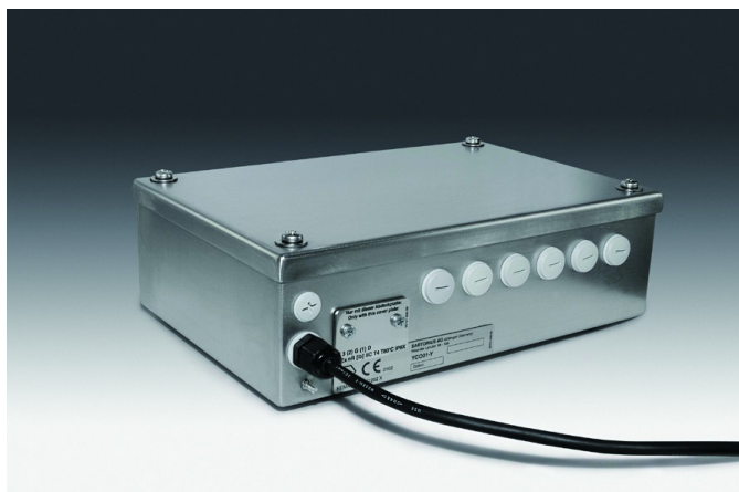
● Safe area installation type