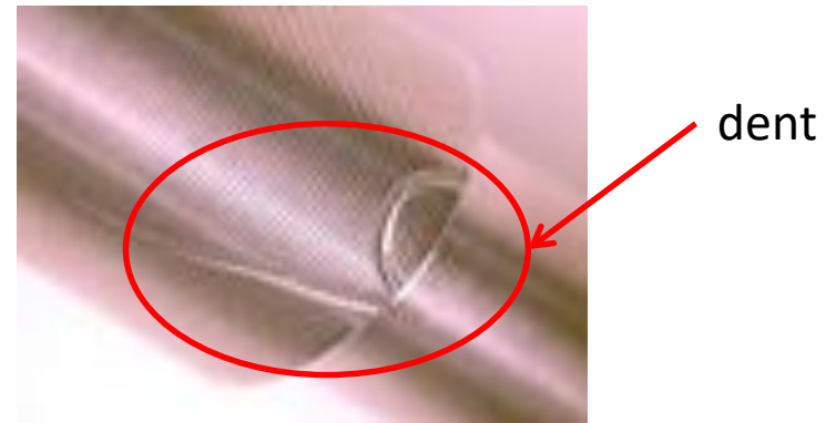
【 Occurrence rate before/after Wavy Nozzle installation】